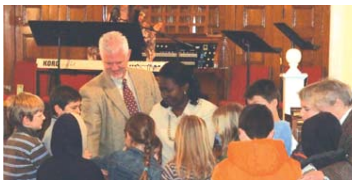
CHILDREN LAY HANDS ON NEW CONSISTORY MEMBERS